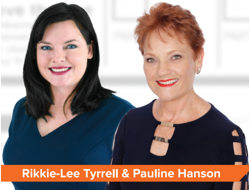
Rikkie-Lee Tyrrell & Pauline Hanson